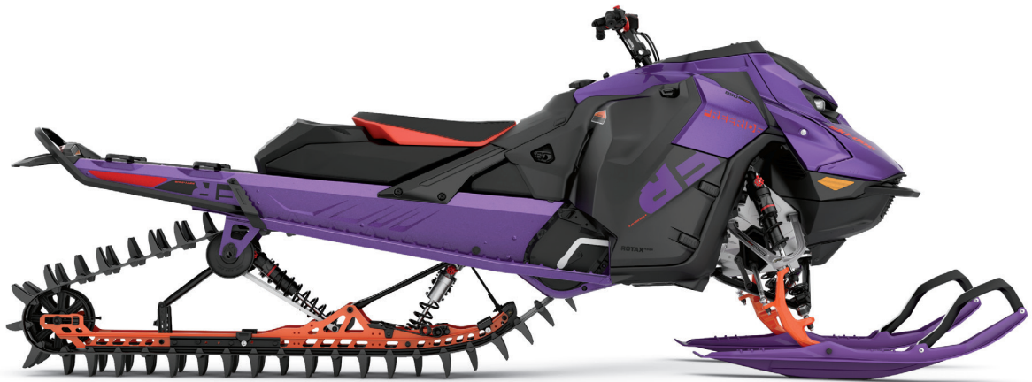
FREERIDE™ 154 850 E-TEC TURBO R SHOWN

Unleash the wheelie monster with the 147x3.0 track—agility meets traction for freestyle fun. Adjustable limiter strap gives you control when terrain gets tough. Go full send or rein it in—your ride, your rules.