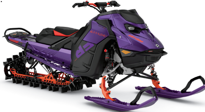
FREERIDE 154 850 E-TEC TURBO R SHOWN