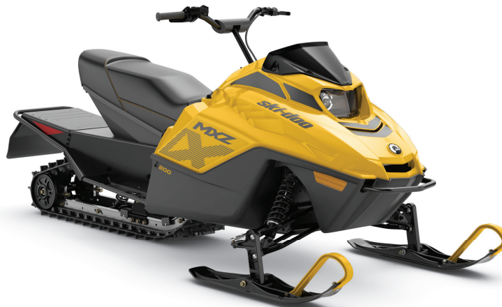
MXZ 200 SHOWN

Youth sled for those who's Ski-Doo life is just beginning! Youth snowmobile for the future pros out there!