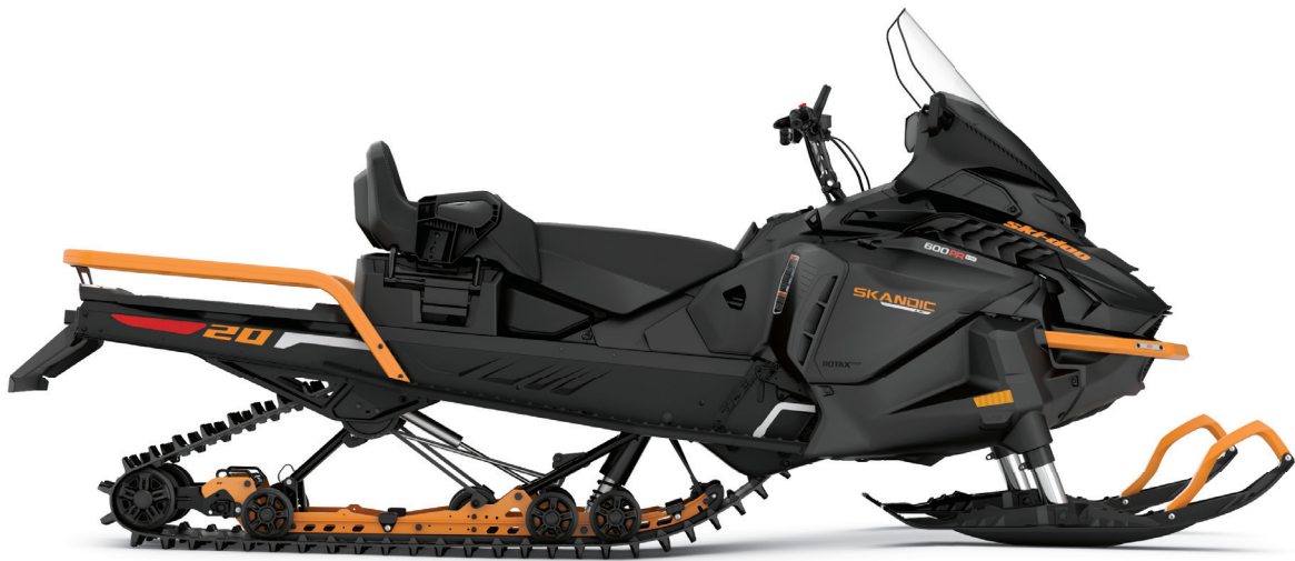
SKANDIC LE 600RR E-TEC SHOWN

Perfectly balanced vehicle dynamics deliver unmatched versatility that's agile and capable both on- and off-trail. With increased travel for a more capable and comfortable riding experience for performance both with and without a load.