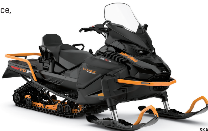
SKANDIC LE 600RR E-TEC SHOWN

The perfect snowmobile for hardworking off-trail performance, now on the REV Gen5 platform.