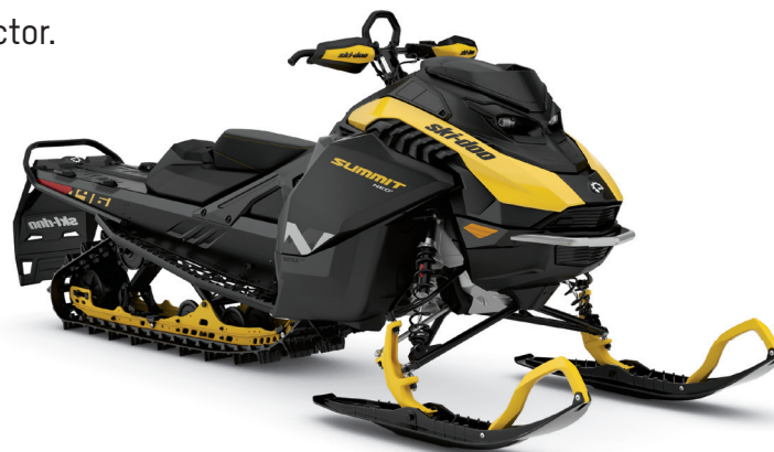
SUMMIT NEO+ SHOWN

An awesome deep snow sled with compact ergonomics that gives riders of any age a less intimidating experience with a full-size fun factor.