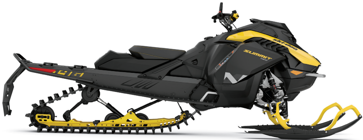
SUMMIT NEO+ SHOWN

Makes the vehicle easier to control and less intimidating. Includes lower vehicle height, smaller seat, lower handlebar, narrow handlebar grips and a shorter displacement throttle lever.