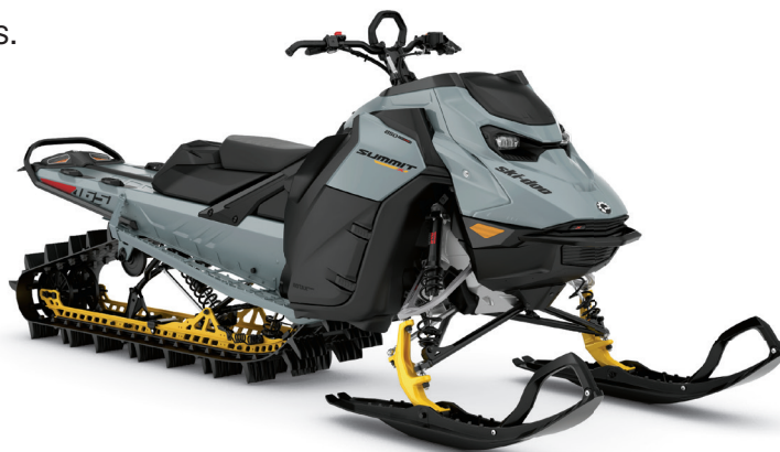
SUMMIT X 154 850 E-TEC® TURBO R SHOWN

Effortless throughout the day, the Summit® X® is the lightest, most agile and nimble of its family with an unmatched degree of playfulness.