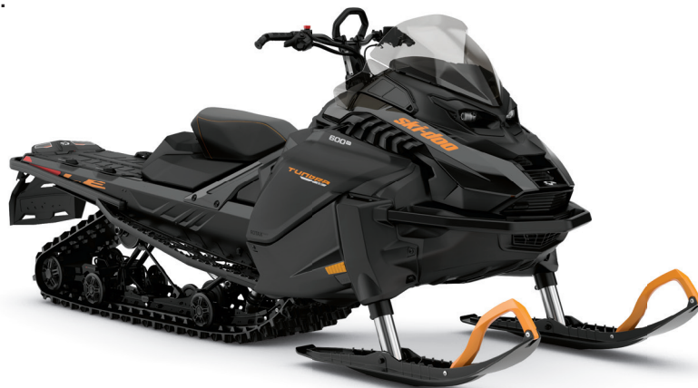
TUNDRA LE 600 EFI SHOWN

Great off-trail and deep snow performance with light-utility capability, now on the REV Gen5 platform.