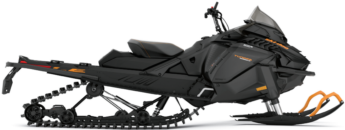
TUNDRA LE 600 EFI SHOWN

Industry-exclusive telescopic front suspension enables a large, flat belly pan for exceptional deep snow flotation.